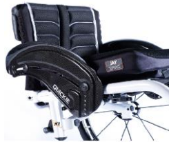
XES040104 Carbon fibre, cold weather protection, fender