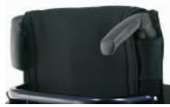
XES 030203 Push handles, fold-down