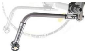
XES090050 Anti-tip tubes, plug in, pair