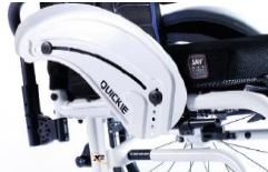
XES040103 Aluminium, cold weather protection, fender