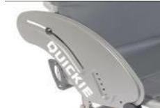
XES040102 Aluminium , cold weather protection