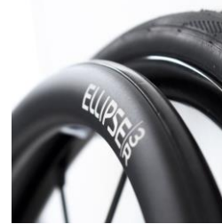
XES070212 Handrims Ellipse 3R