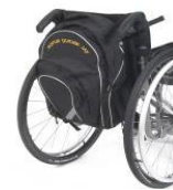
XES090030 Back pack