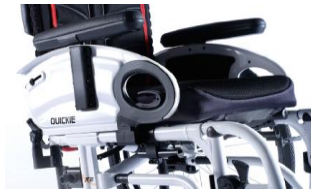
XES04000x Desk sideguard, armpad, flip- up, removable