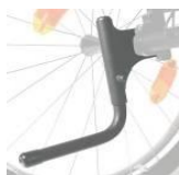
XES090001 Tip assist