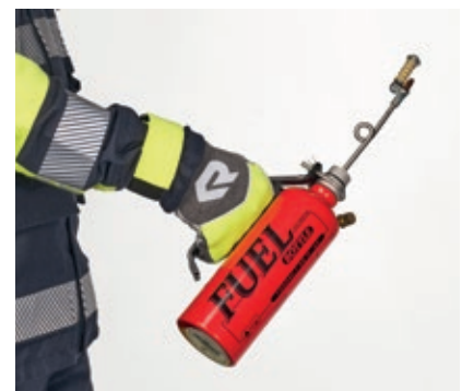
Good grip thanks to durable cowhide leather on the palm