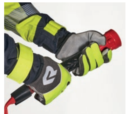
Unrestricted mobility and excellent tactility

The performance levels were confirmed after 5 wash cycles (40 °C). Note: These gloves offer no protection against bacterial, chemical, electrical, or thermal hazards.