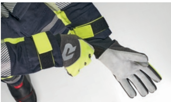
The GLOROS F10 complements Rosenbauer's personal protective equipment for wildfires.

The palm is made of hard-wearing gray full-grain cowhide leather, which is reinforced between the thumb and index finger. A special nylon fiberglass lining ensures the necessary cut protection. Flame-retardant modified acrylic in gray and yellow protects the back of the hand, while a comfort fleece on the inside dissipates moisture and heat to keep you comfortable - even on long operations.