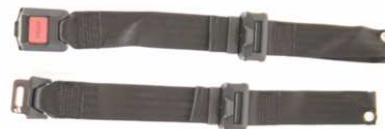
Lap belt with buckle, metal