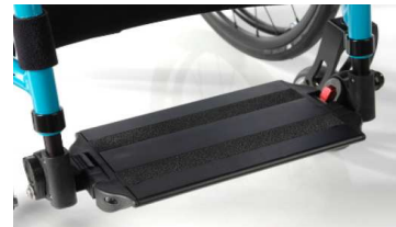
Platform, angle and depth adjustable; flip up, aluminium with locking system