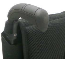
Push handles long