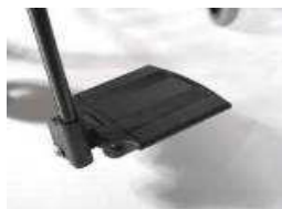
Divided footplate aluminum