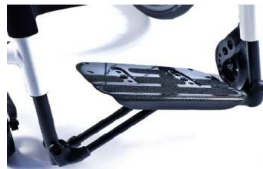
Footboard platform, lightweight, carbon fibre, auto folding