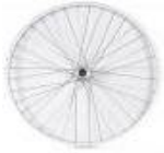
Universal cross spoked