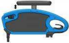
Desk armrest, height adjustable, short armpad(25cm)