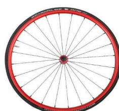
Lightweight wheel, anodized red