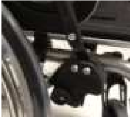
One arm wheel lock