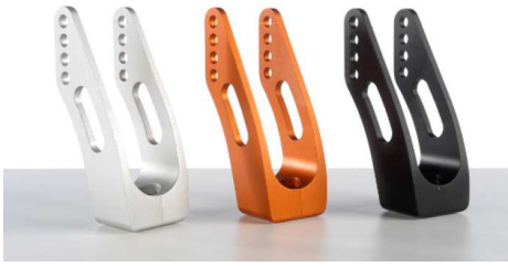
Fork Aluminium, black, orange & silver