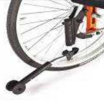
Anti-tip swing away