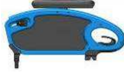
Desk armrest, fixed height, short armpad(25cm)