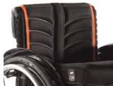
EXO PRO backrest sling