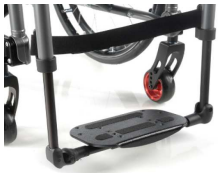
Platform footplate lightweight angle & depth adjustable composite flip up