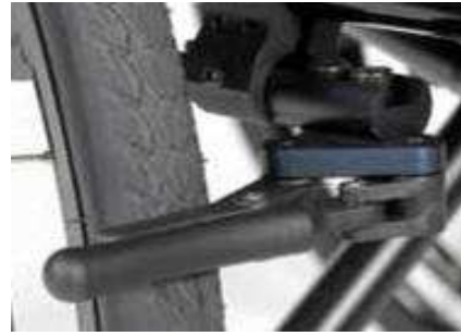
Compact wheel lock