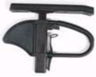
Single post height adjustable armrest Koma standard.