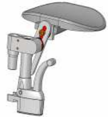
Amputee Support Pad