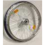
Drum brake wheel