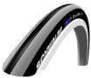
Right Run Tyre