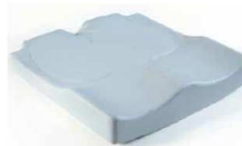
Jay Easy Visco (picture shown without upholstery)