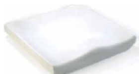
Jay Basic (picture shown without upholstery)