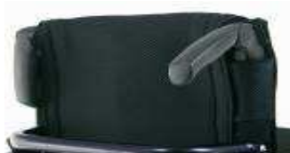
Fold down push