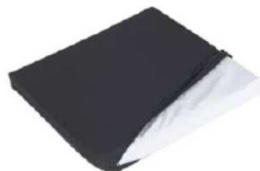
Seat cushion, climate membrane water-resistant, cover with zipper, black