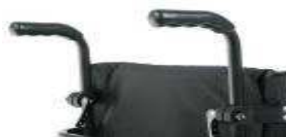
Height adjustable push handles