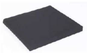
Seat cushion, cover with zipper, black