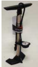
High pressure pump