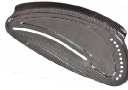
Sideguard carbon with fender