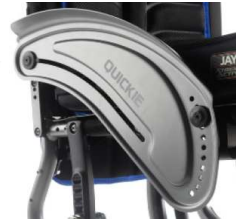
Sideguard alu with fender