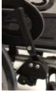
Brake lever extension