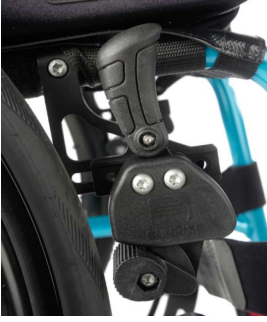
Knee lever wheel lock