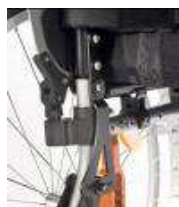
Angle adjustable back -12° to 12°