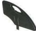
Sideguard composite detachable