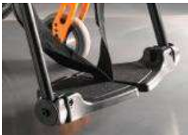
Divided footplate composite