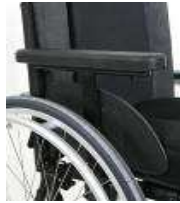
Single-post sideguard, depth adjustable, tool height-adjustable