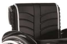
EXO backrest sling