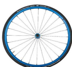
Lightweight wheel, anodized blue