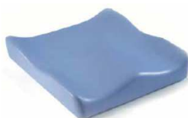
Jay Soft Combi P (picture shown without upholstery)