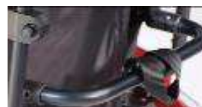
Autofolding Stabilizer Bar