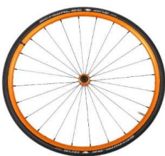
Lightweight wheel, anodized orange