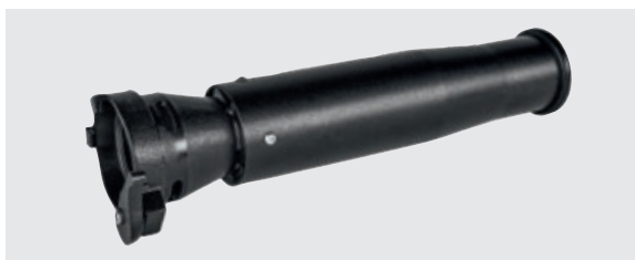
Low expansion foam attachment