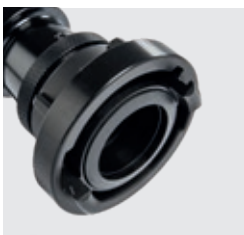
Storz B or C